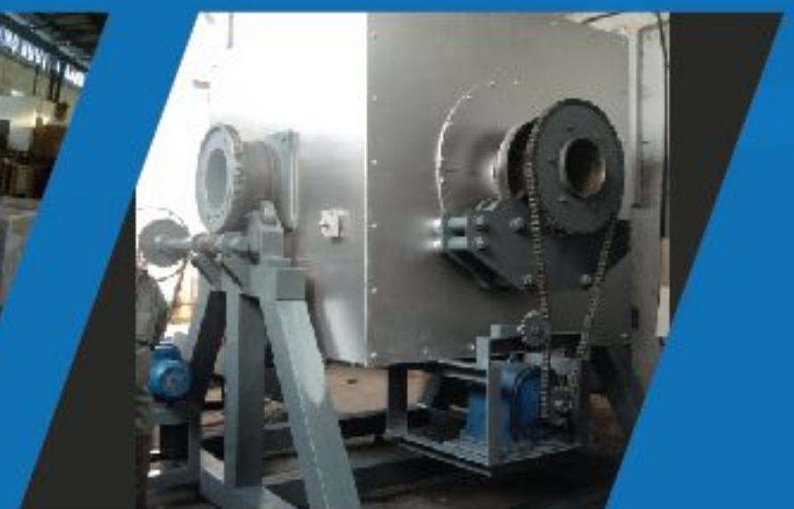
Rotary Retort Furnace

World Class Infrastructure & Efficient Team