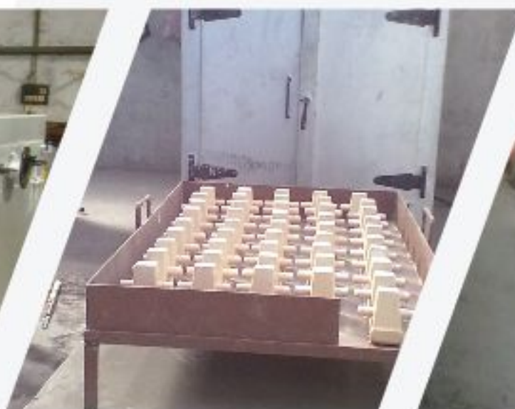
Core Drying Oven