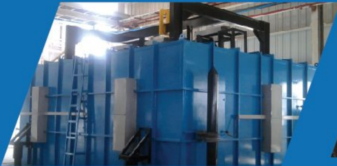
Rectangular Type Bell Furnace