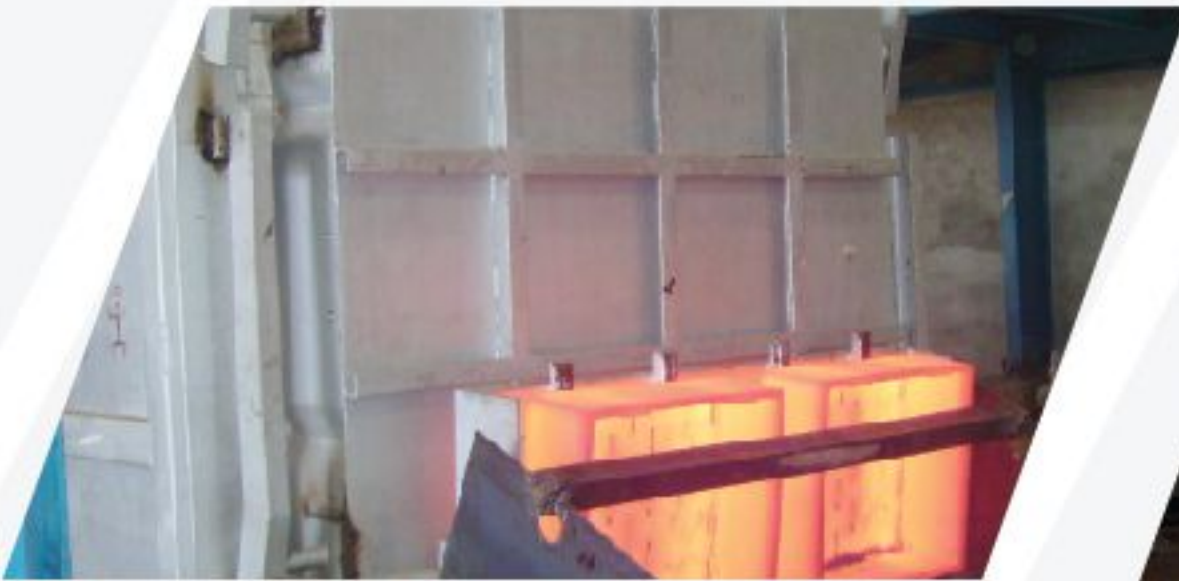
Chamber Type Forging Furnace