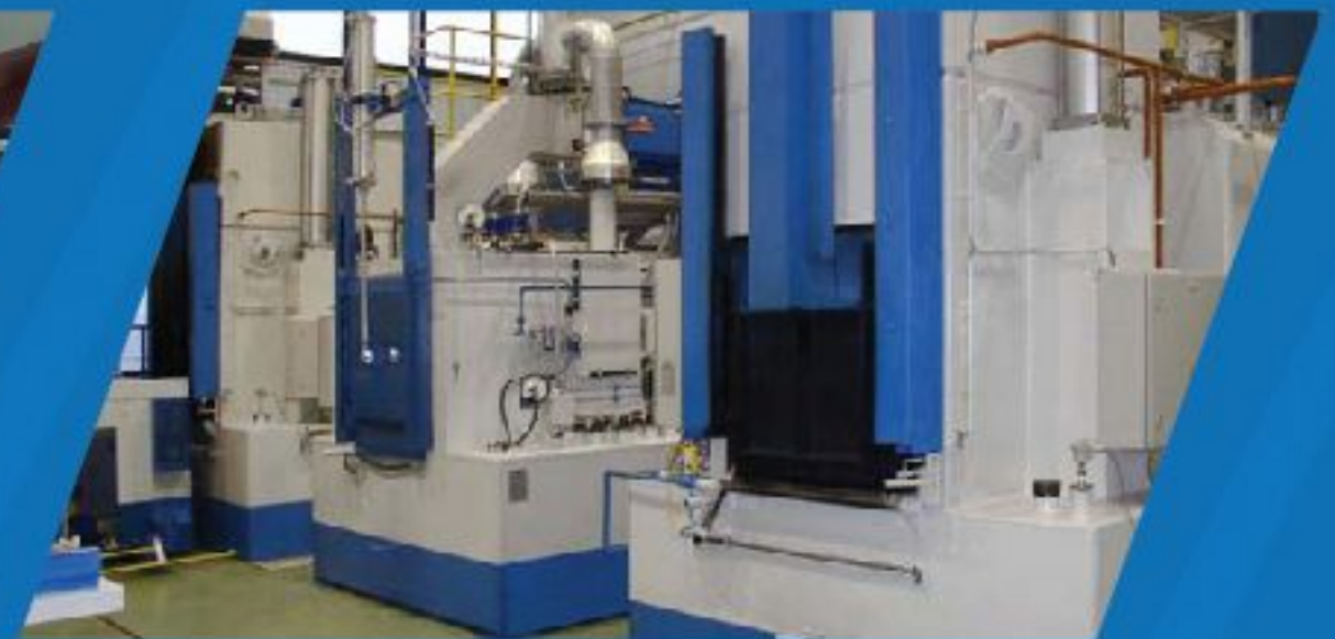
Sealed Quench Furnace Line