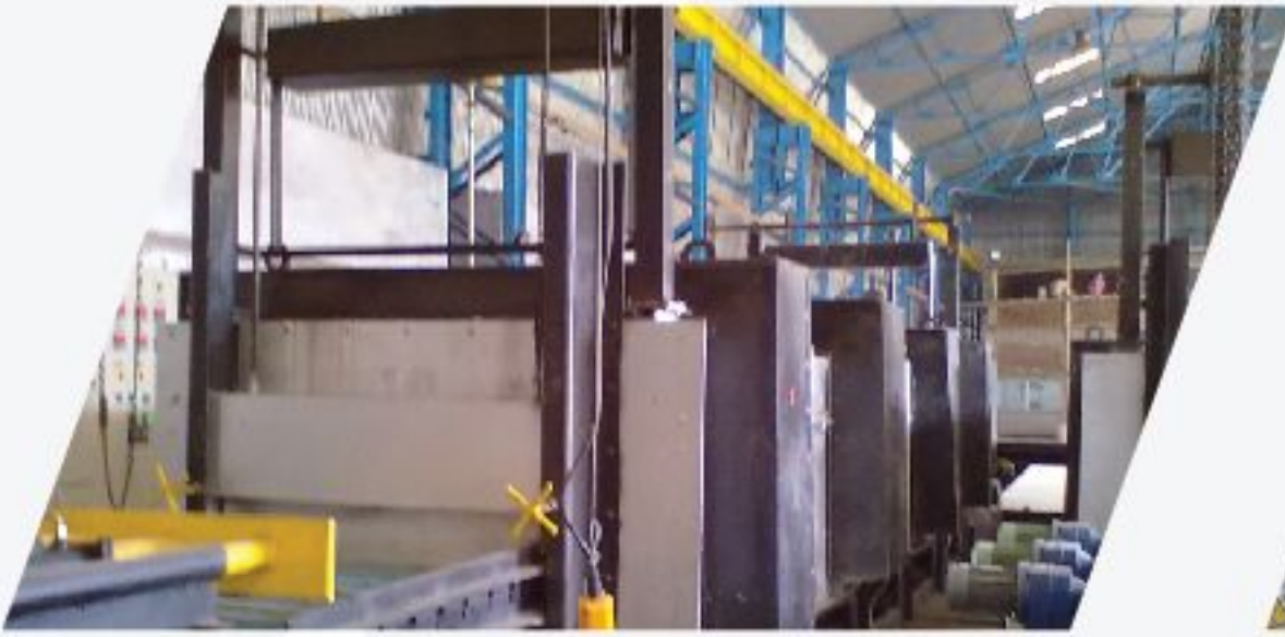
Pusher Type Hardening & Tempering Furnace