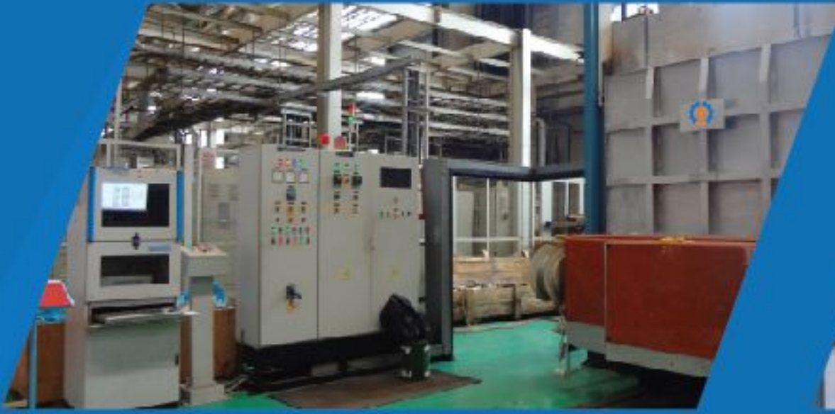
Bogie Hearth Annealing Furnace