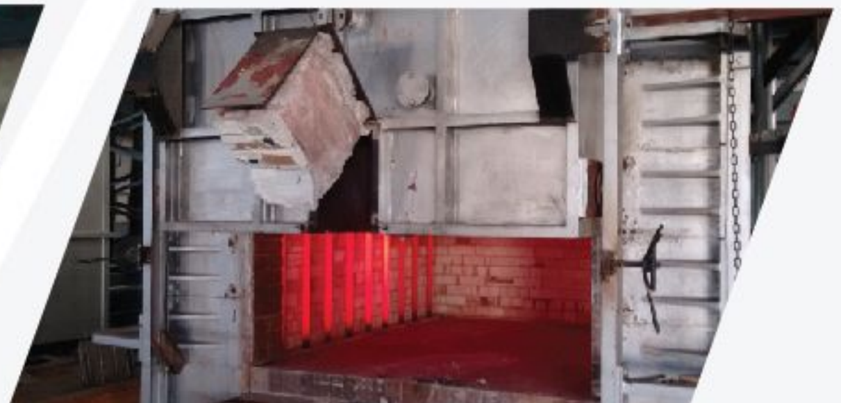
High Temperature Furnace