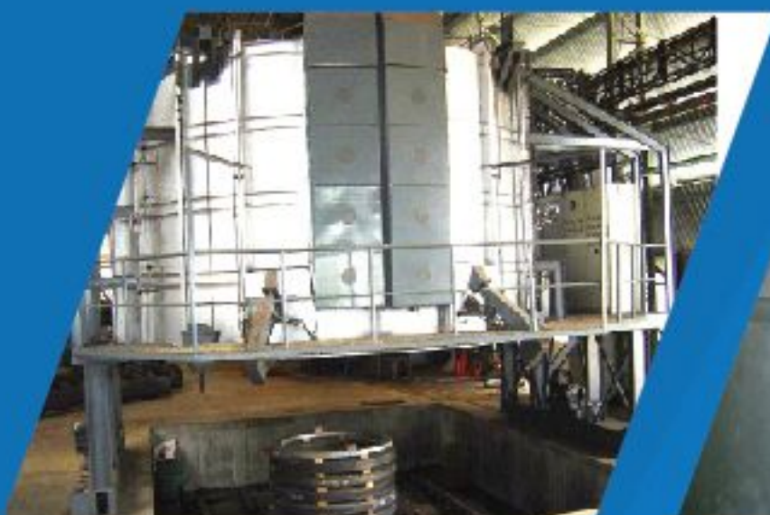
Drop Bottom Quench Furnace