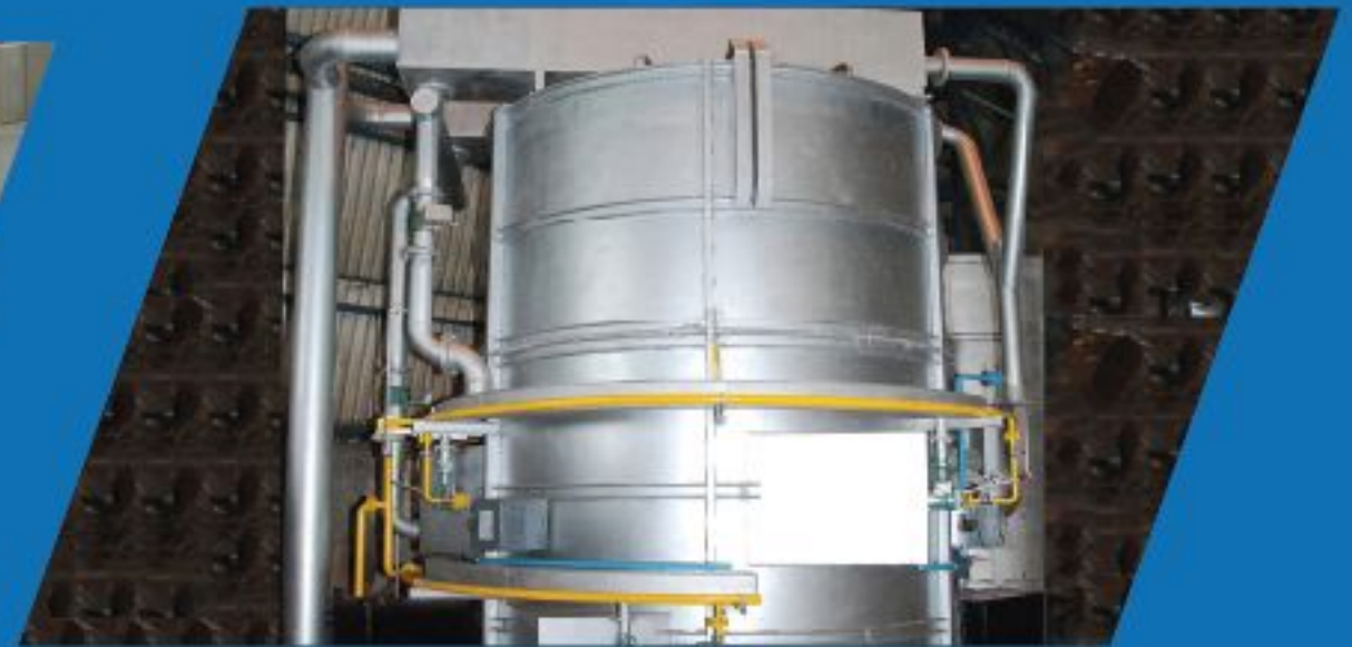
Bell Type Furnace