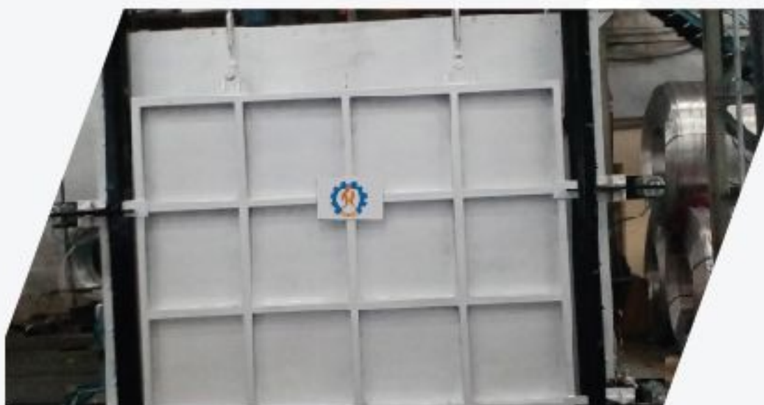
Ageing Furnace For Alloy Conductors