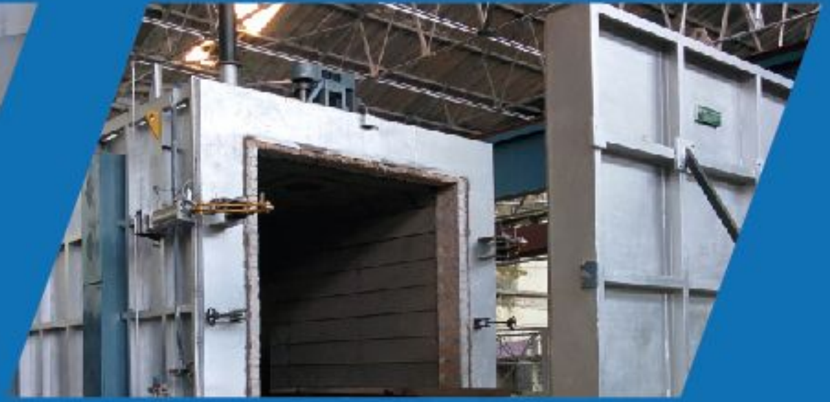
Stress Relieving Furnace