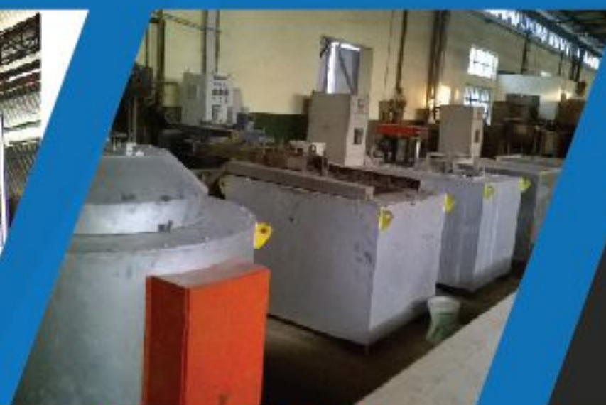
Austempering Plant Saltbath Furnace, Preheating, Isothermal